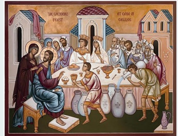
Wedding Feast at Cana

Stevens Point Deanery Marriage Preparation